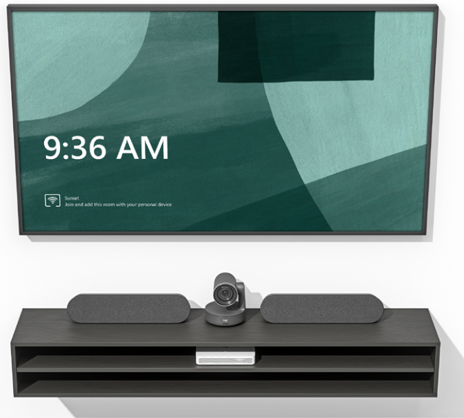
Logitech RoomMate shown with Rally Plus system