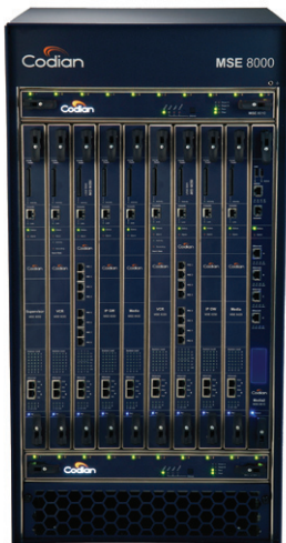
MSE 8000 Chassis

High-capacity voice and videoconferencing media services engine. This powerful, fault tolerant solution is ideal for the large scale communication needs of large enterprises and service providers requiring a high-availability, high-performance, scalable solution.